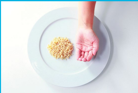
1 cupped handful of carb dense foods with most meals