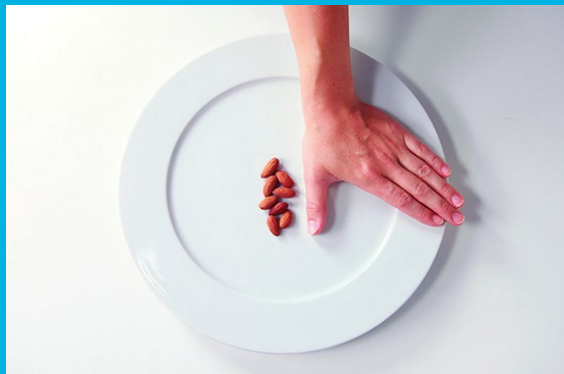
1 entire thumb of fat dense foods with most meals

Note: Your hand size is related to your body size, making it an excellent portable and personalized way to measure and track food intake.