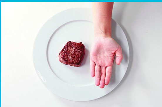
1 palm of protein dense foods with each meal